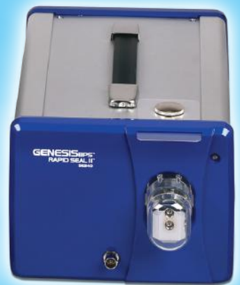
RAPID SEAL II™ SE330 & SE340 STANDARD BENCHTOP UNIT

Component processing is too important to leave to chance.