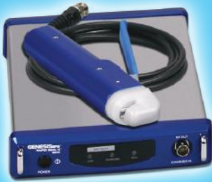
RAPID SEAL II™ SE640 PORTABLE UNIT