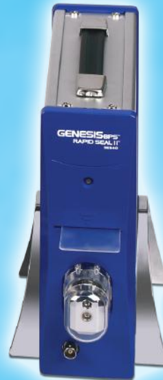
RAPID SEAL II™ SE540 SPACE SAVING BENCHTOP SEALER