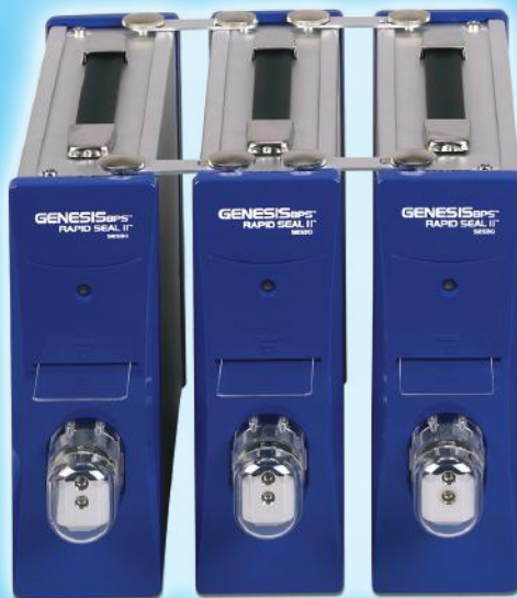
RAPID SEAL II™ SE530 MULTI-HEAD SEALER